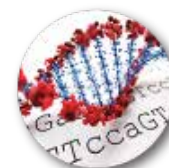
Reagents & Assays