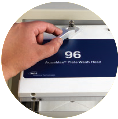
Figure 1. User-interchangeable heads. The user-interchangeable 96 and 384 wash heads can be exchanged and re-attached very quickly to the washer manifold using a simple lever mechanism.