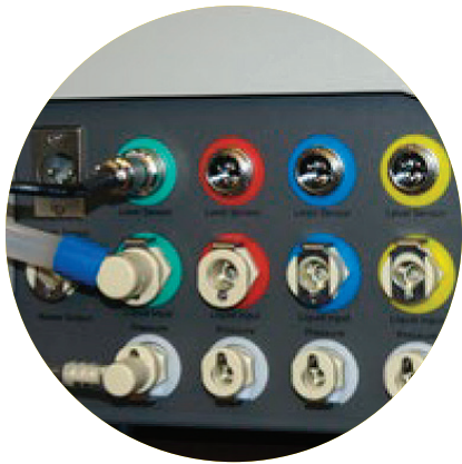
Figure 2. Color-coded inlet connectors. Color-coded inlets with quick connects decrease assembly time and allow the use of multiple buffers and solutions without bottle switching. The level sensors, when connected to the reservoir bottle sensors, detect if bottles are empty or full.