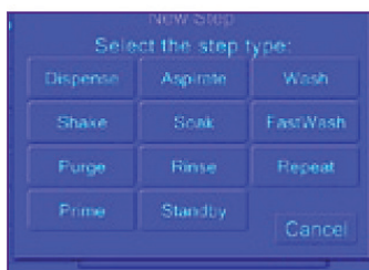
Figure 3. Touchscreen system control. Using the front panel LCD, program control features can be easily selected to set up, edit, delete, copy, and rename wash protocols, create new microplates in the microplate library, or perform washer maintenance.