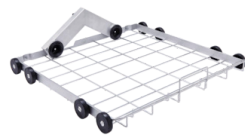
A150 Lower Basket