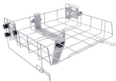
A102 Upper Basket