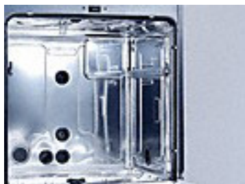
Stainless steel interior/exterior for durability and cleanliness