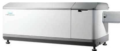
J-1500 Highest performance with a wide range of accessories to meet complex demands