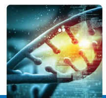
Consumables & Assays