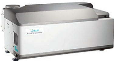
J-1100 The basic model, perfectly suited for QA/QC and teaching applications