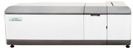
J-1700 UV/Visible/NIR up to 2500nm for MCD and specialized applications