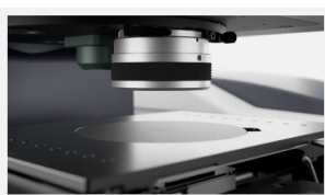
Options for FTIR Microscope and IR Imaging