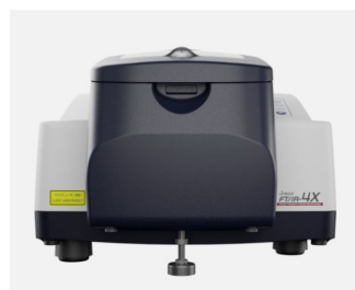
Large Sample Compartment

Accessories: available at additional cost