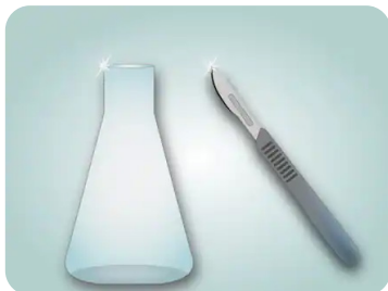
Optimum Cleaning Performance