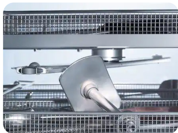
Spray Arm Sensing