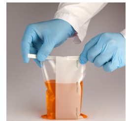
Step 5 Fold in ends to provide air-tight and leak-proof closure