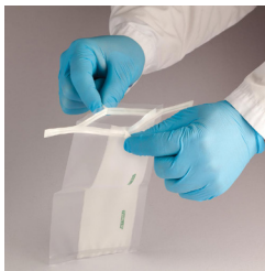
Step 2 Use pull-tabs to pull open the bag