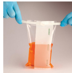
Step 4 Hold bag by wire ends and twirl to close