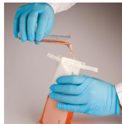
Step3 Place your sample in to the bag