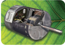
Energy-Efficient DC ECM Motor