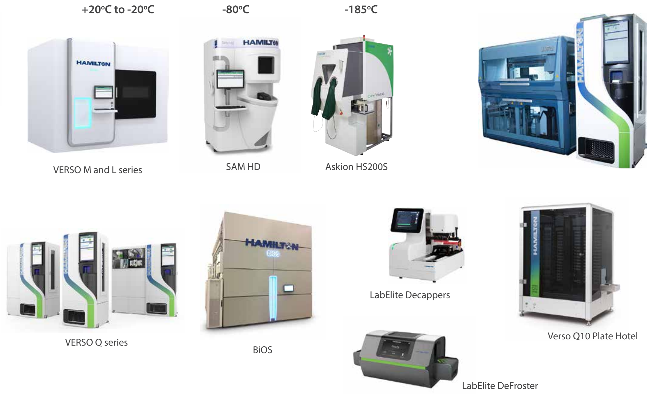
+20°C to -20°C

Grenova automated tip washers to accommodate most industry brand tips ensuring sustainability.