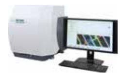
Confocal Raman Microscope