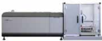
Automated High-Throughput CD (HTCD)